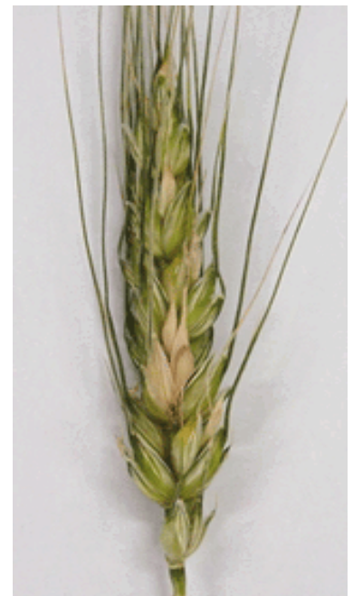
Figure 1. Bleached spikelets within the grain head

Severity of infestation is best determined in the field through two metrics: incidence and intensity. Disease incidence is determined by counting the percentage of heads out of a hundred with any infestation in a random sample taken throughout a field. Intensity is determined by calculating an average percentage of spikelets infected