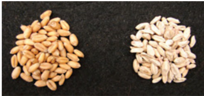
Figure 3. Healthy kernels (left) and shriveled, bleached FHB diseased kernels (right)