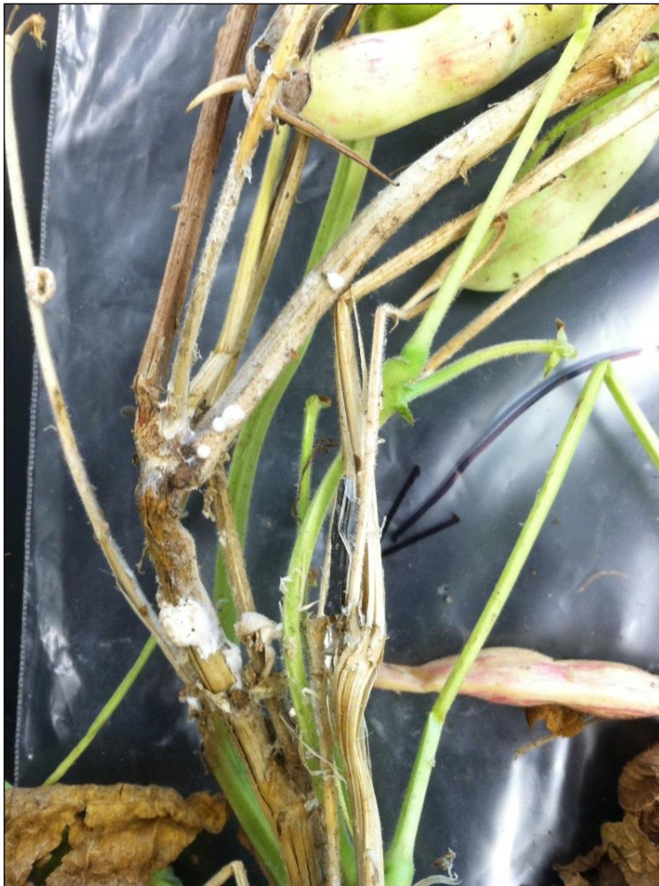
Sclerotinia (white mold)